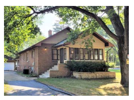
1817 E. Elm St., Griffith $225,000