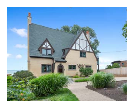
SOLD! 7500 Oak Ave.