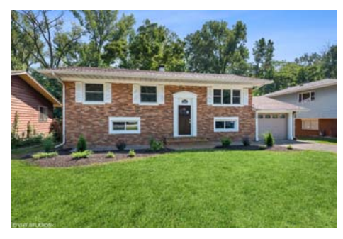
PENDING! 9333 Juniper Ave. $199,900