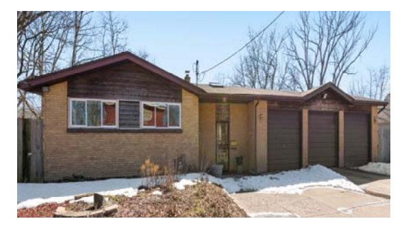
SOLD! 6017 Juniper Ave