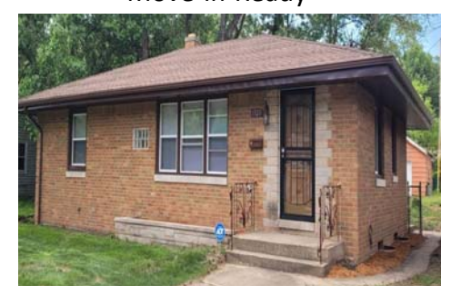
SOLD! 1320 W. 47th Ave.