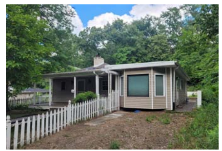
PENDING! 841 N. Vermillion St. $279,900