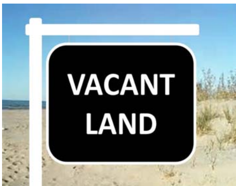
Lake view lot